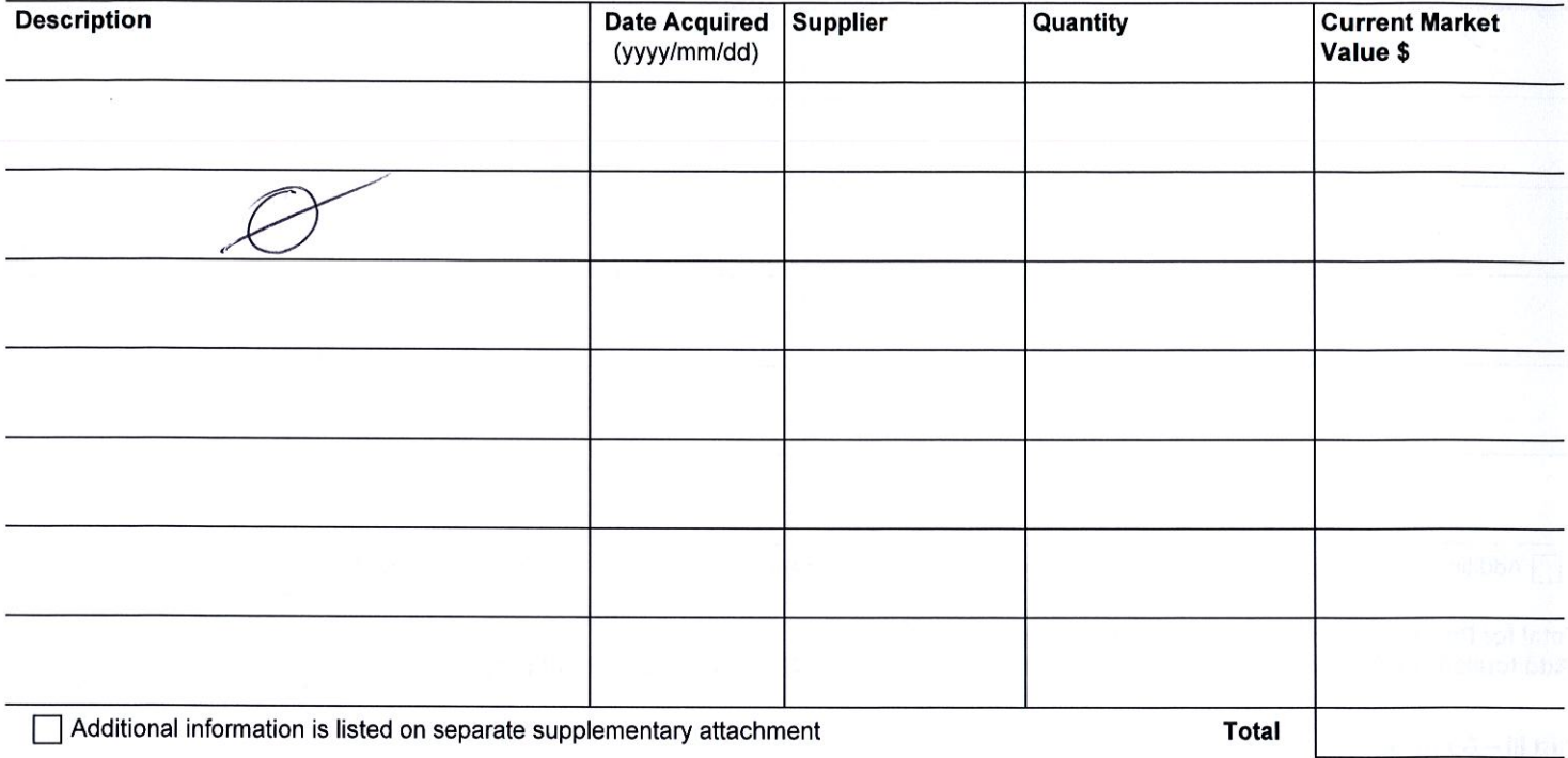
Table 4: Inventory of campaign goods and materials from previous municipal campaign used in this campaign (Note: value must be recorded as a contribution from the candidate and as an expense)